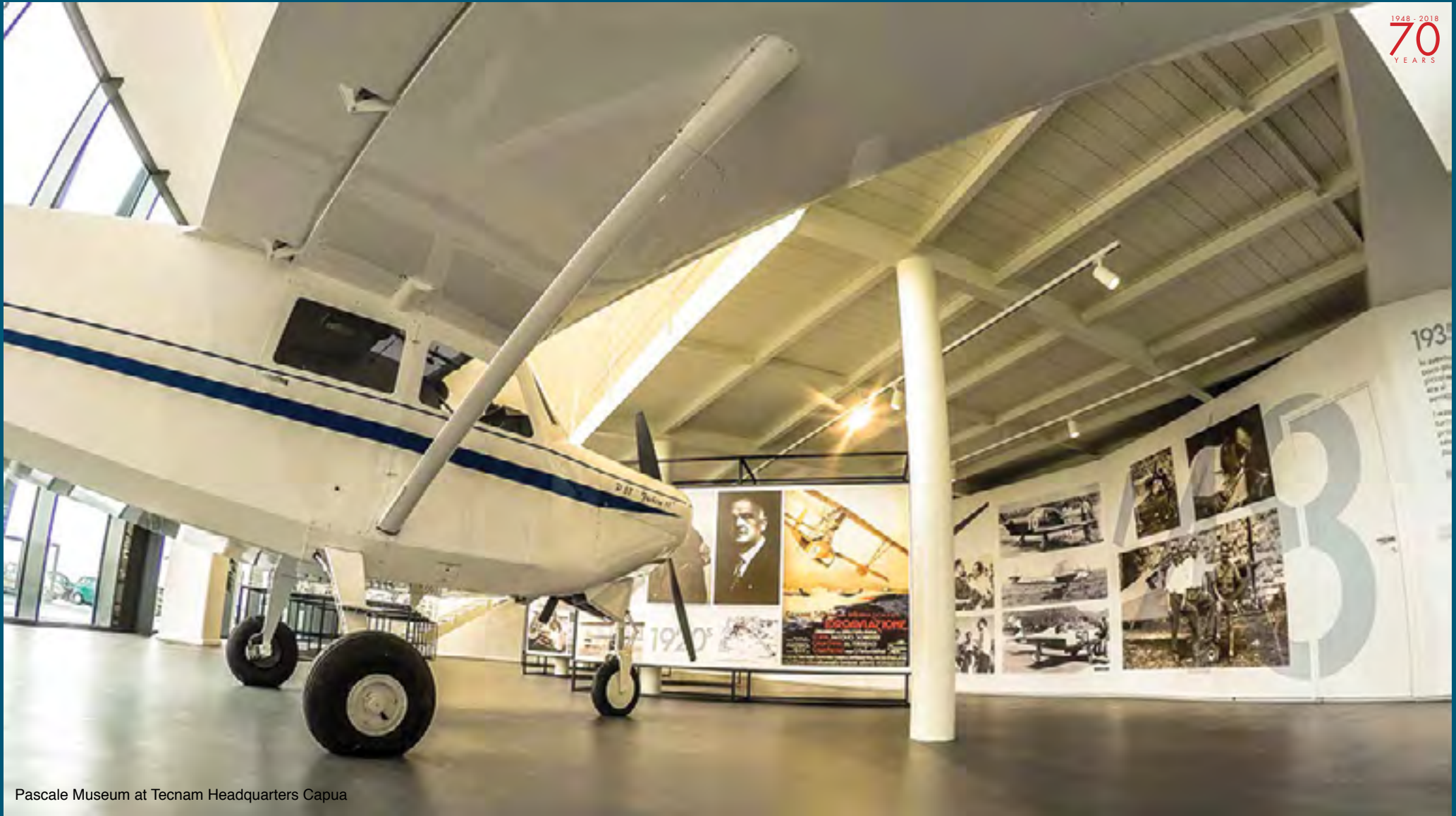
Pascale Museum at Tecnam Headquarters Capua

Costruzioni Aeronautiche Tecnam SpA Via Maiorise 81043 Capua CE - Italy Tel. +39 0823 622297 Fax. +39 0823 622899 www.tecnam.com info@tecnam.com